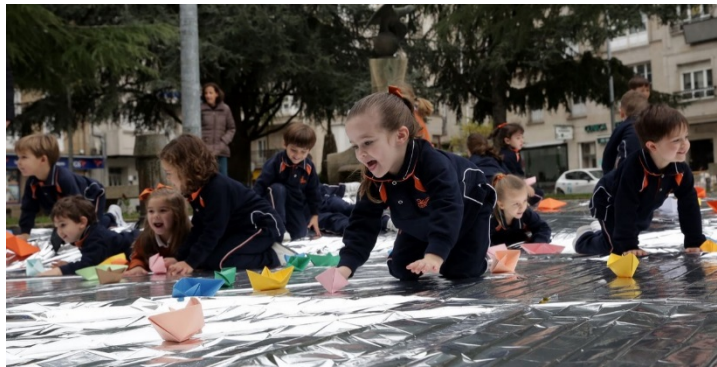
Figure 5. Playing with perception. Workshop: "The City of Tomorrow, Vilagarcía de Arousa".