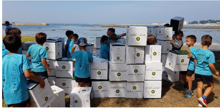
Figure 12. Transforming the city working with 3d elements. Workshop: "The City of Tomorrow, Cambados".