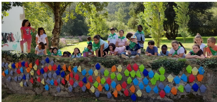
Figure 11. Transforming the city working with the plane. Workshop: "The City of Tomorrow, Arteixo".