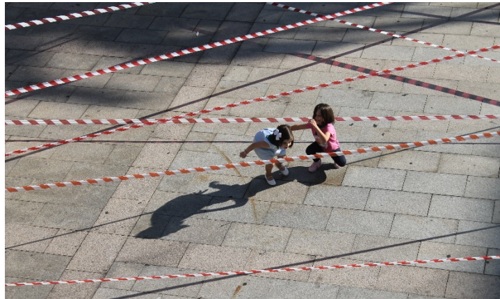
Figure 1. Invasion of urban space. Workshop: "The City of Tomorrow, Riveira".