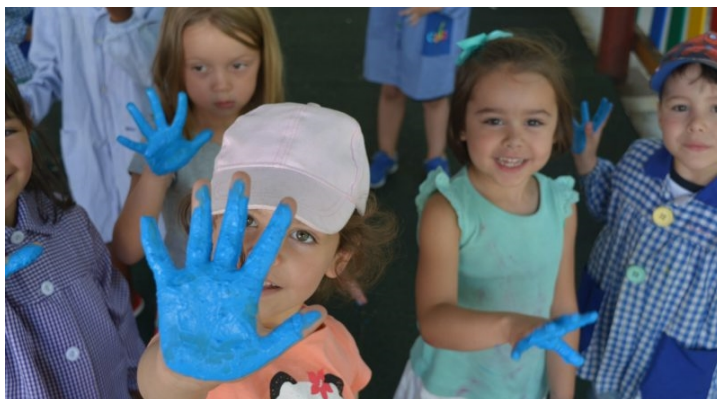
Figure 7. Working with the scale, of the hand to the horizon. Workshop: "The City of Tomorrow, Verín".