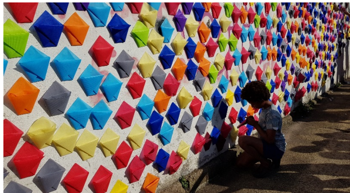
Figure 2. Transforming the city. Workshop: "The City of Tomorrow, Ferrol".