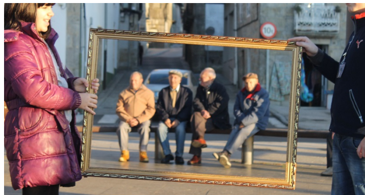
Figure 3. What would you frame in your city?. Workshop: "The City of Tomorrow, Rianxo".