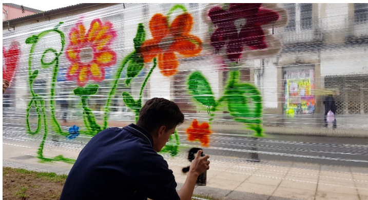
Figure 6. Playing with perception. Workshop: "The City of Tomorrow, Vilagarcía de Arousa".