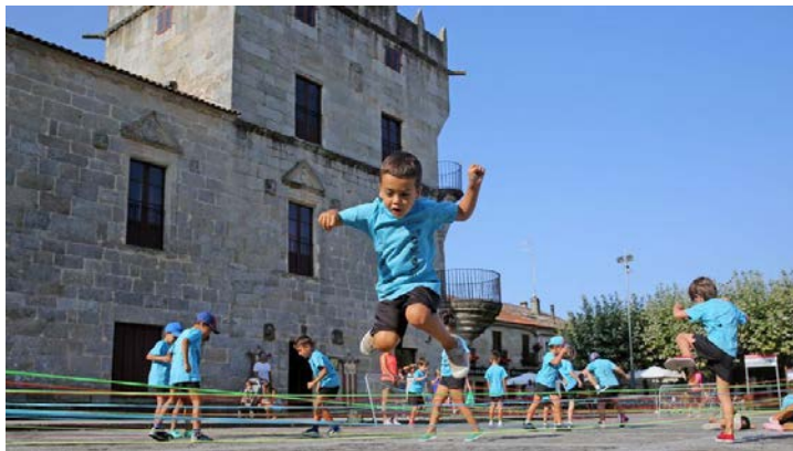
Figure 10. Transforming the city working with the line. Workshop: "The City of Tomorrow, Cambados".