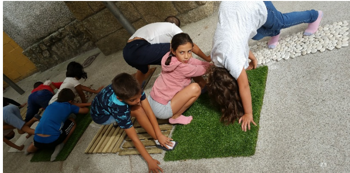
Figure 9. Experimenting with new textures. Workshop: "The City of Tomorrow, A Pobra do Caramiñal".