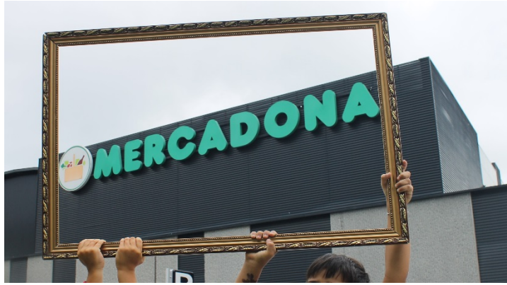
Figure 4. What would you frame in your city?. Workshop: "The City of Tomorrow, Milladoiro".