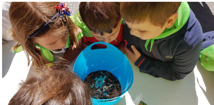
Figure 13. Transforming the city working with natural elements. Workshop: "The City of Tomorrow, Vilagarcía de Arousa".